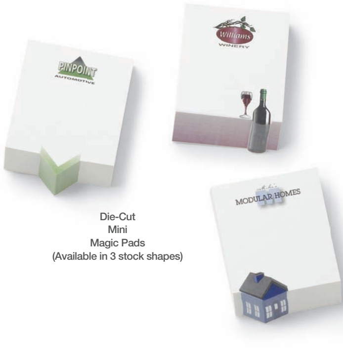
Die-Cut Mini Magic Pads (Available in 3 stock shapes)

These magical effects will amaze and enchant!